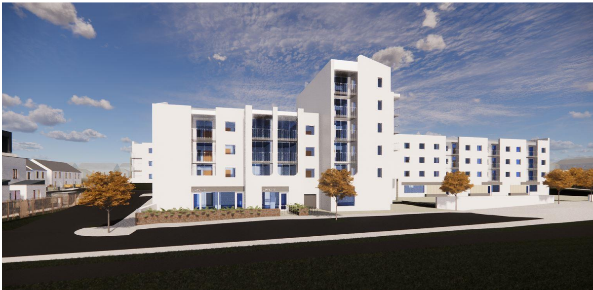
Ballyburke Neighbourhood Centre & Social Housing Scheme