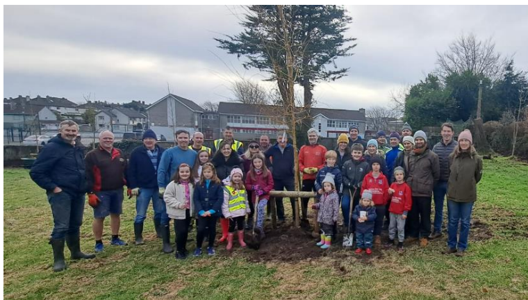
Community tree & hedge planting day in Glenard Park