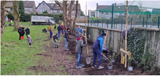
Native hedge planting along boundary with St Enda's NS, Glenard Park