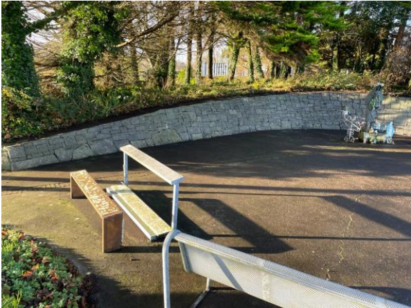
Clean up to Grotto on Ragoon Road by Community Service Initiative Team