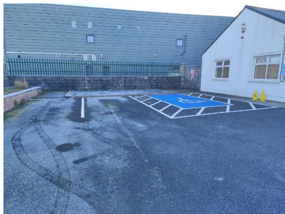
New line marking has been installed at dog pound.