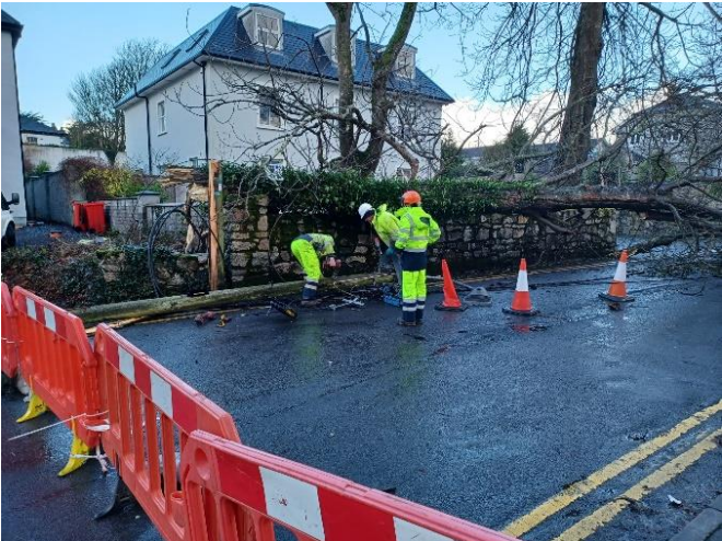
Clean up operation for tree that came down on ESB pole at Rockbarton Road