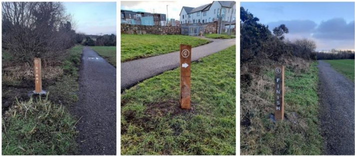
Cappagh Park pathways resurfacing and new trail posts works